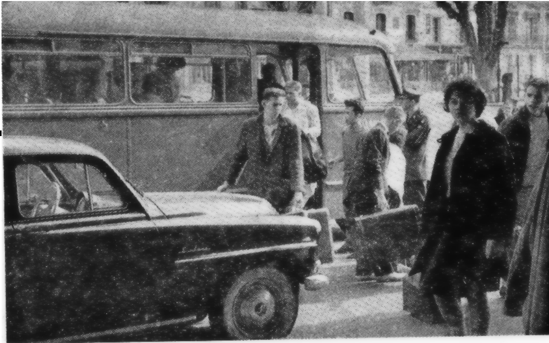
Army buses bring the students from caserns to the Poitiers train terminal.