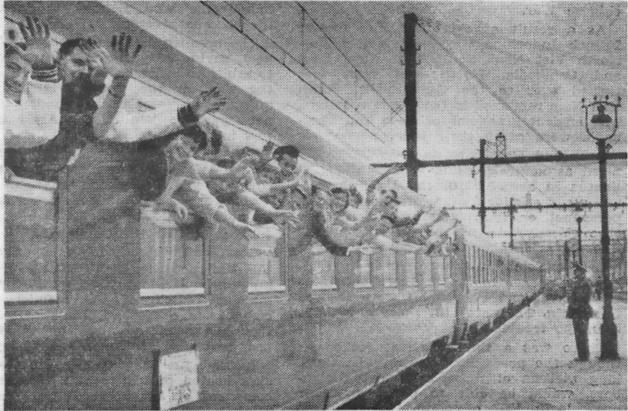
Farewell waves and goodby shouts— They're homeward bound for the weekend.